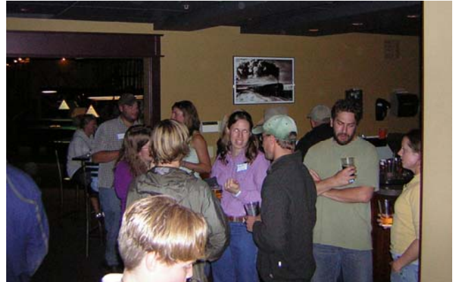
Student colloquium opening night social.

The MSU-AFS subunit would like to thank all of the participants in this year's Student Colloquium and would particularly like to thank the Western Division of AFS, the Montana Chapter of AFS, and Montana State University for their generous contributions. Thanks to the effort of so many, the first annual WDAFS Student Colloquium was a success!